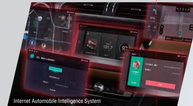
Internet Automobile Intelligence System

Inkalink Infotainment System, iPhone CarPlay - screen Interconnection, full support iOS and Android.