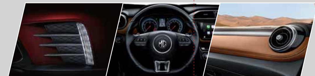
Front and rear vent trim

The new MG GS is designed to put the 'Sport' back in SUV. A throwback to its British heritage, the new car design is a hybrid of rugged, muscular exteriors combined with premium, luxurious interiors.