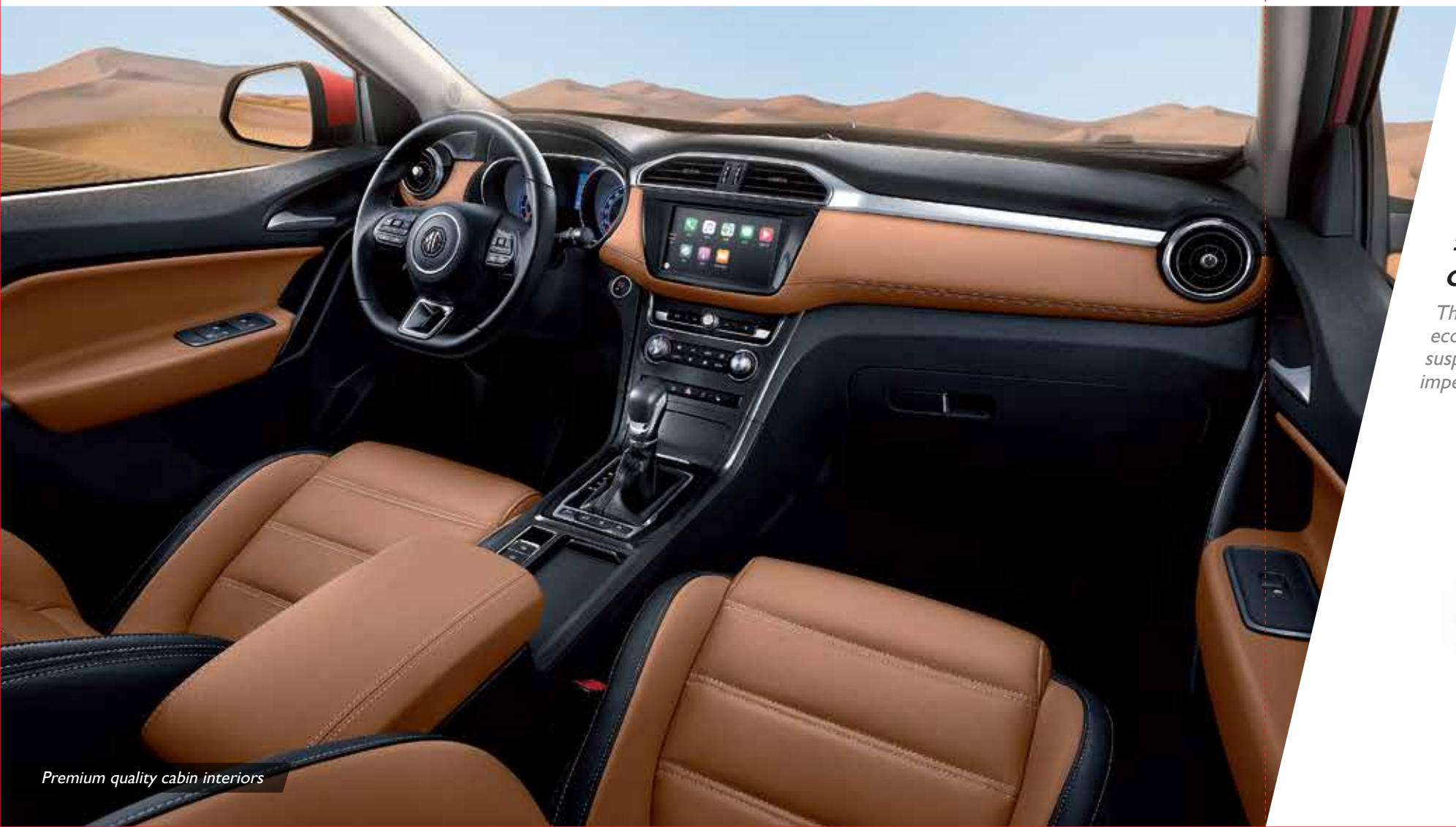
Premium quality cabin interiors