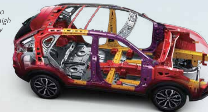
FSF ultra-high strength all in one car body