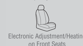
Electronic Adjustment/Heating on Front Seats